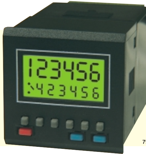
7931 IN COUNTER MODE

This versatile count up or count down predetermining counter with prescaler has a wide range of innovative and attractive features. Designed with imagination and built to the highest standards it offers both counting and timing functions in one unit.